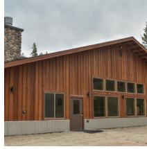
Our Capital Campaign has Reached it's Goal and New Day Lodge is Ready for this Season